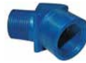
AN915 ELBOW, INTERNAL AND EXTERNAL PIPE THREAD, 45°