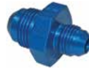
AN919 REDUCER, EXTERNAL THREAD